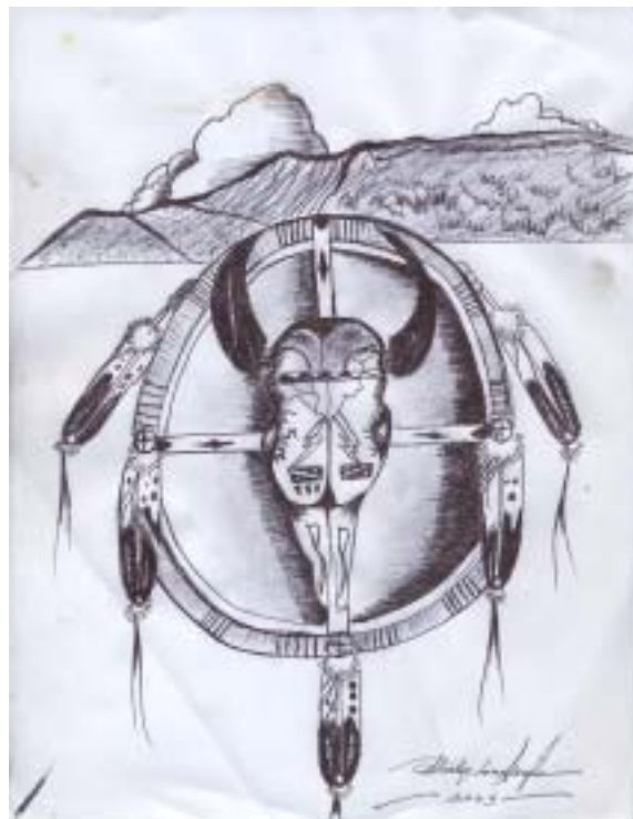
Original Artwork by Stanley Longknife