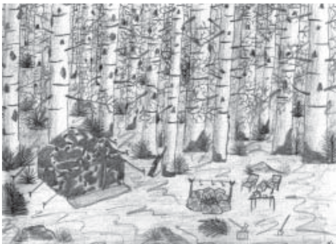
Opening Day