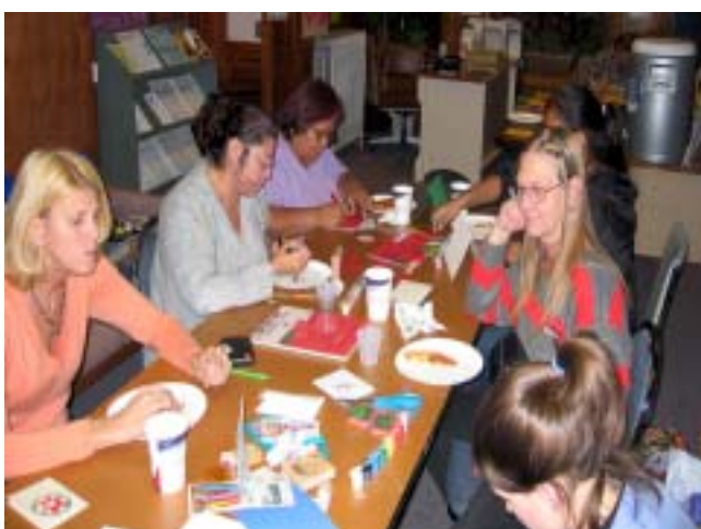
AHAC members make Holiday Cards at Novembers Open Arts