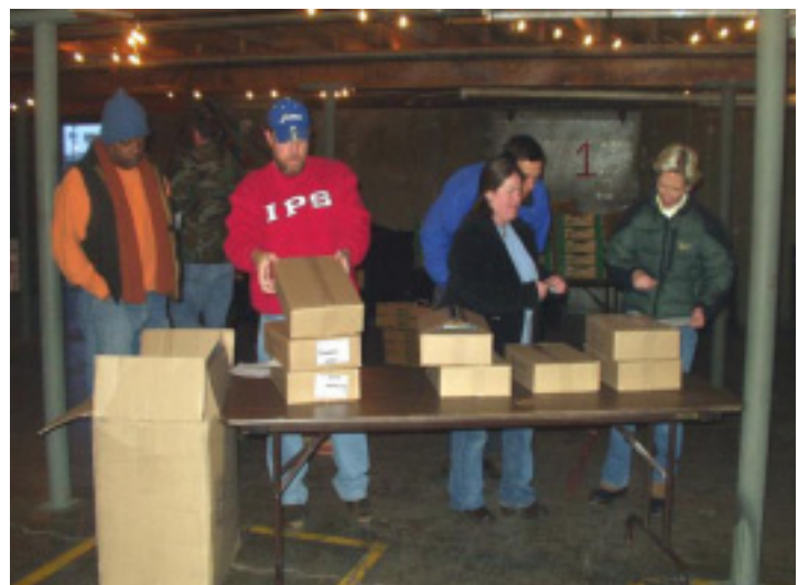
Opening day of the Community Food Co-op!!!