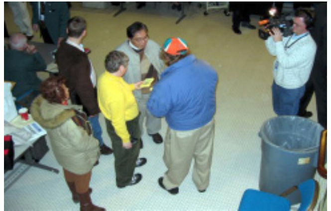
AHAC members strategize before talking to Utah Legislators and the media