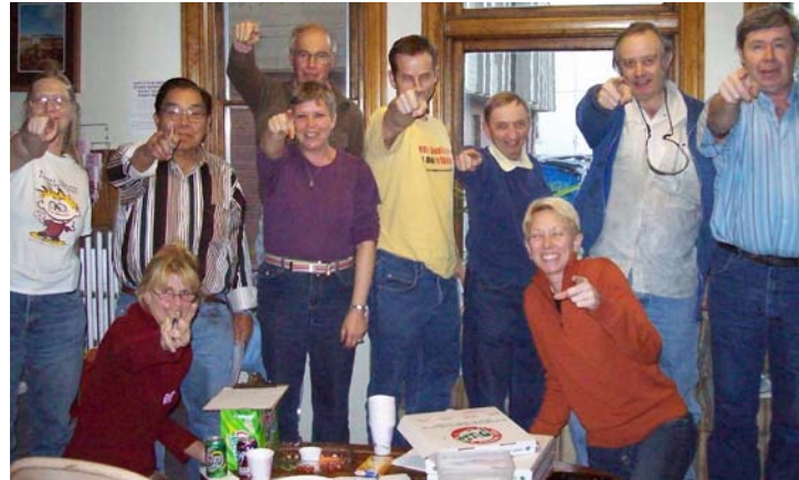
The AHAC board encourages you to vote. YOU can make a difference!

The survey targeted three specific issues that impact low-income people: healthcare, housing, and sales tax on food. The graph below indicates the percentage of people who ranked each issue on a scale of “extremely important” to “somewhat important.” Respondents could choose “not important,” but that category had such a low percentage it's not included on the chart.