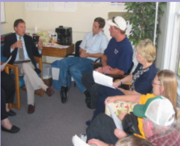
Members of AHAC meet with Gary Herbert