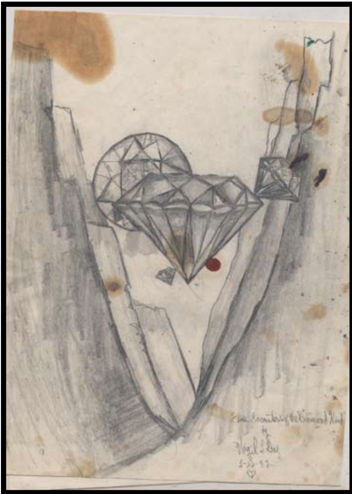
LEFT: Art by Virgil Day. "Close Encounters of the Diamond Kind." February 22, 1982.